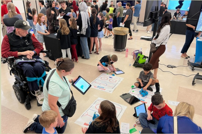
04.14.26 -Orland School District 135 Innovator Expo (Orland Park)