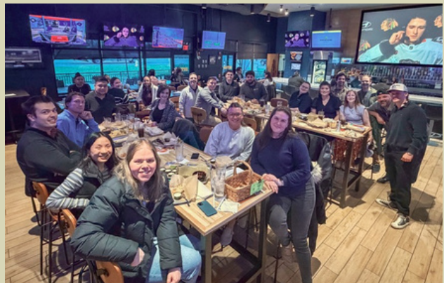
03.24.26 - Young Professionals at Buffalo Wild Wings (Tinley Park)