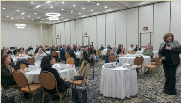
03.26.26 - Monthly Membership Meeting w/ Salus Training Systems at Elements by the Odyssey (Orland Park)