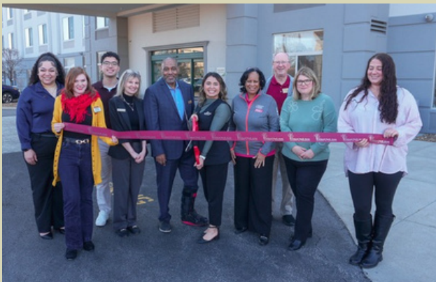
03.12.26 - Wingate by Wyndham Ribbon Cutting (Tinley Park)