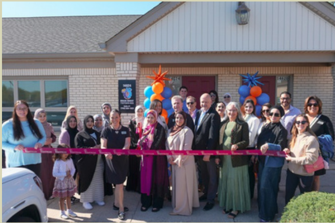
04.23.26 -Brain Boost Tutoring Ribbon Cutting (Orland Park)