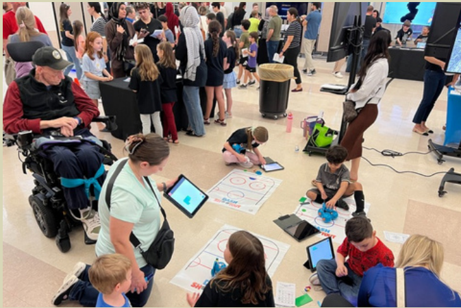
04.14.26 -Orland School District 135 Innovator Expo (Orland Park)