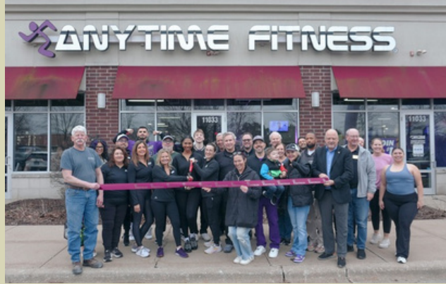
03.10.26 - Anytime Fitness Ribbon Cutting (Orland Park)