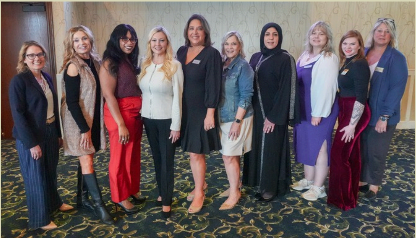
Orland Women's Network Committee 2026