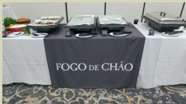
04.22.26 - Monthly Membership Meeting Lunch Sponsor, Fogo De Chão