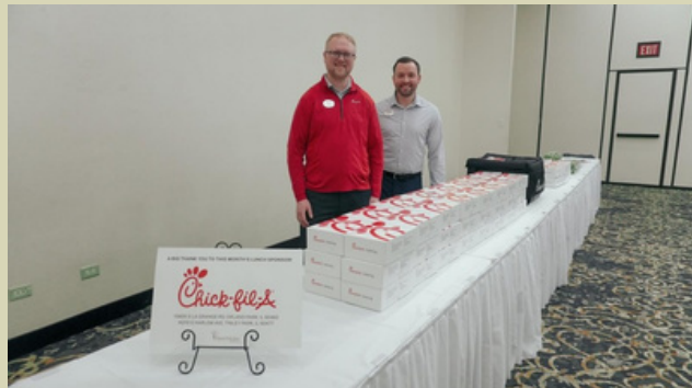
03.26.26 - Monthly Membership Meeting Lunch Sponsor, Chick-fil-A