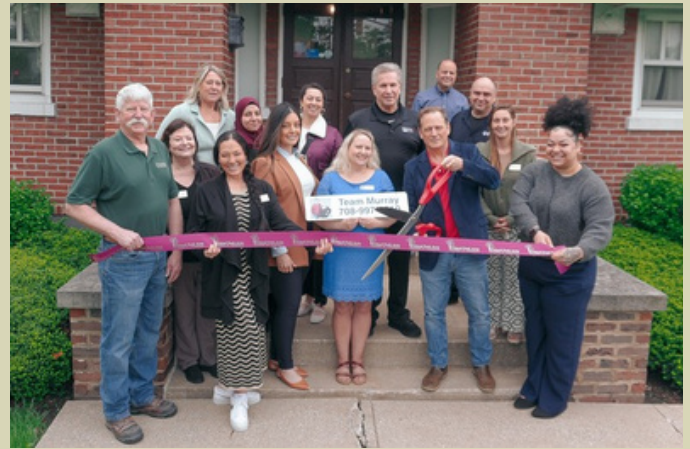
04.28.26 -Team Murray | McColly Real Estate Ribbon Cutting (Orland Park)