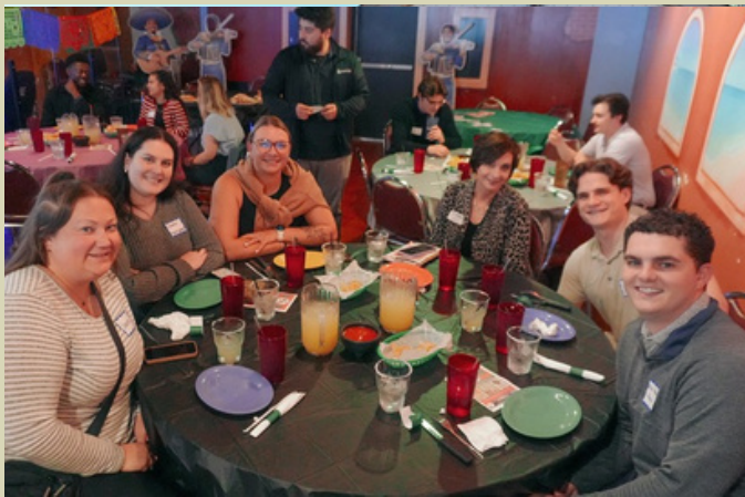
04.28.26 -Young Professionals at El Cortez (Mokena)