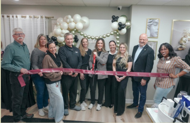
03.03.26 - Midwest Medical Weight Loss & Aesthetics Ribbon Cutting (Orland Park)