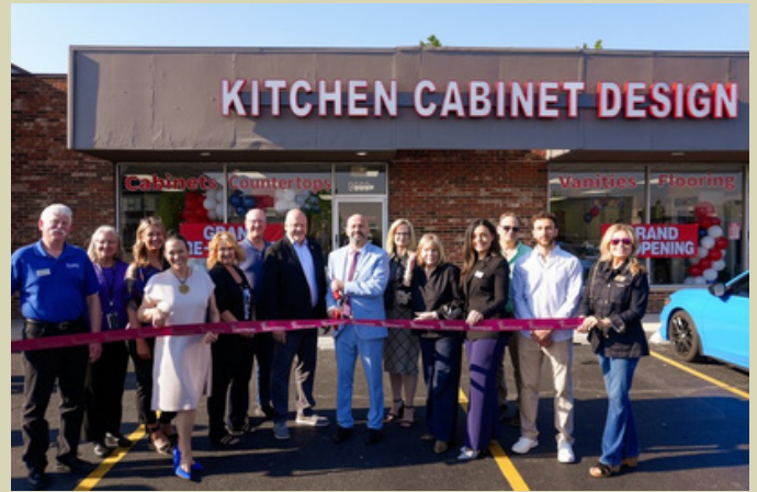
04.22.26 -Kitchen Cabinet Design Ribbon Cutting (Orland Park)