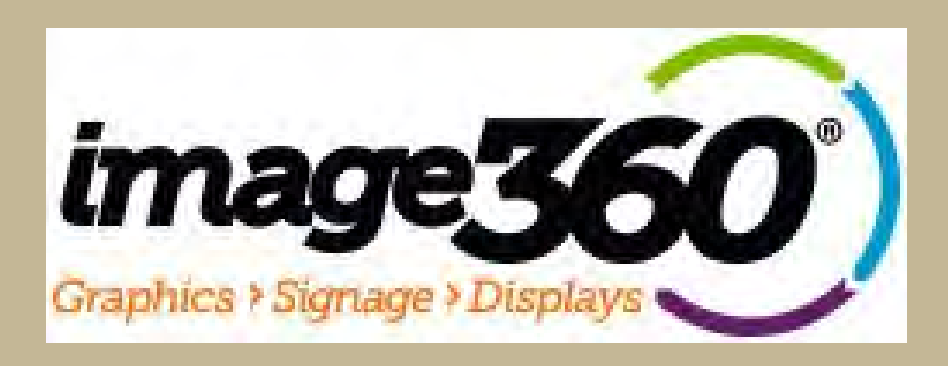
IMAGE360 IN MOKENA HONORED WITH SALES AWARD

Local signage and graphic solutions provider earns international recognition