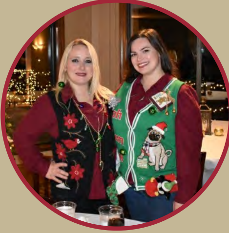
Governors State University