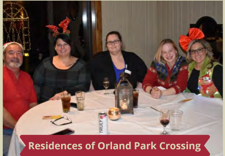
Residences of Orland Park Crossing