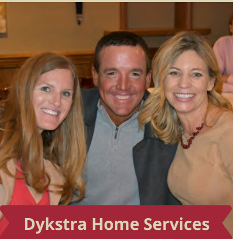
Dykstra Home Services