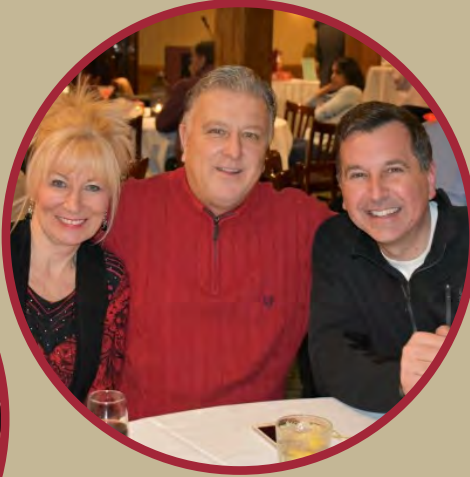
Shark Shredding, Inc