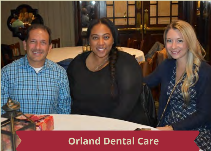
Orland Dental Care