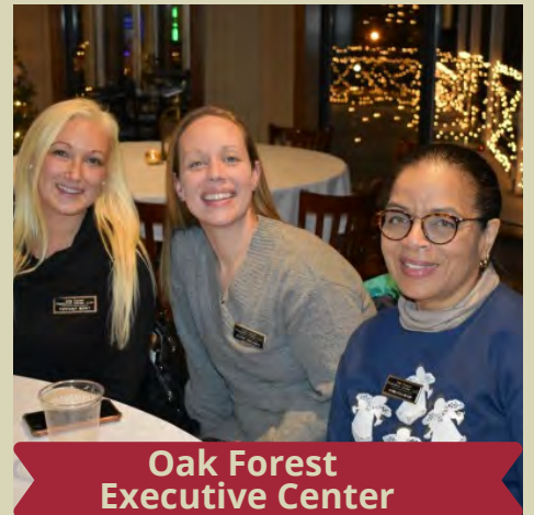
Oak Forest Executive Center