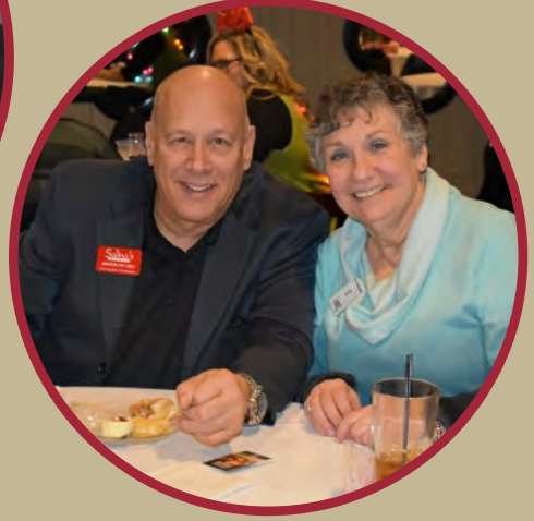
Salina's Pizza - Catering - Rentals