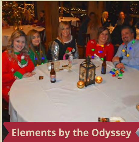
Elements by the Odyssey