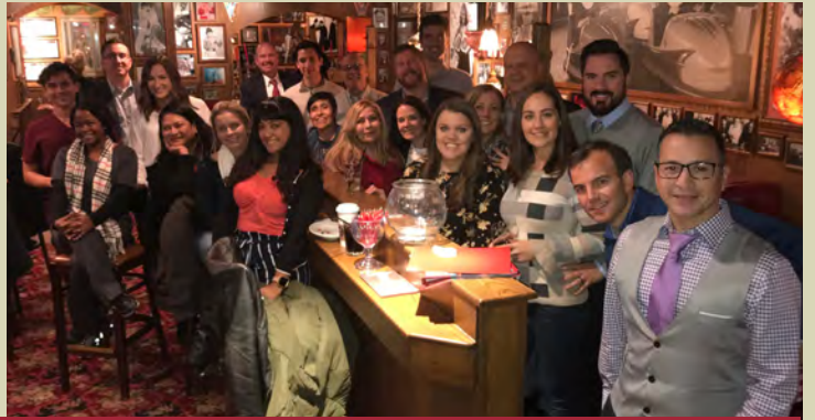
Young Pros at Bucca di Beppo