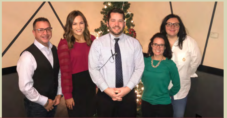
Young Pros at Dave & Buster's